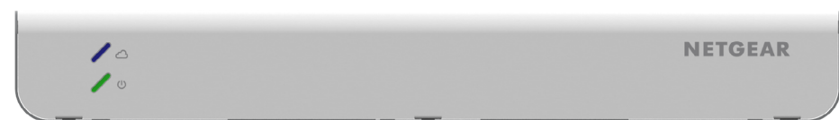
Front panel models GC110 and GC110P

8-Port Gigabit Ethernet PoE Smart Cloud Switch with 2 SFP Fiber Ports (GC110P)