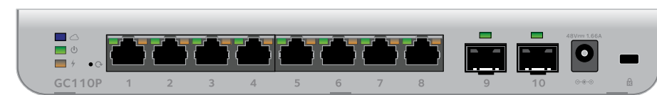
Rear panel model GC110P