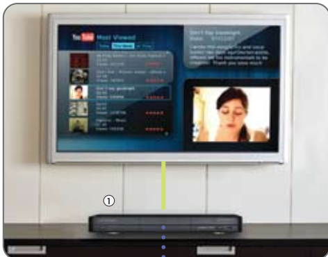
1. Digital Entertainer Elite